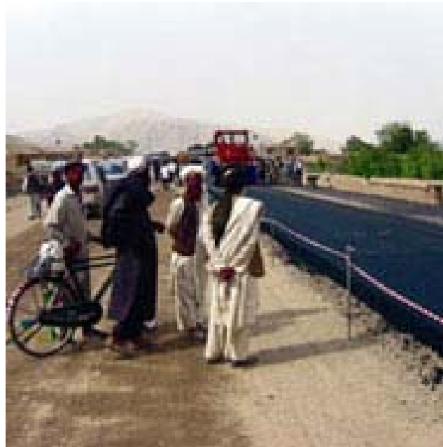
Highway Building in Afghanistan