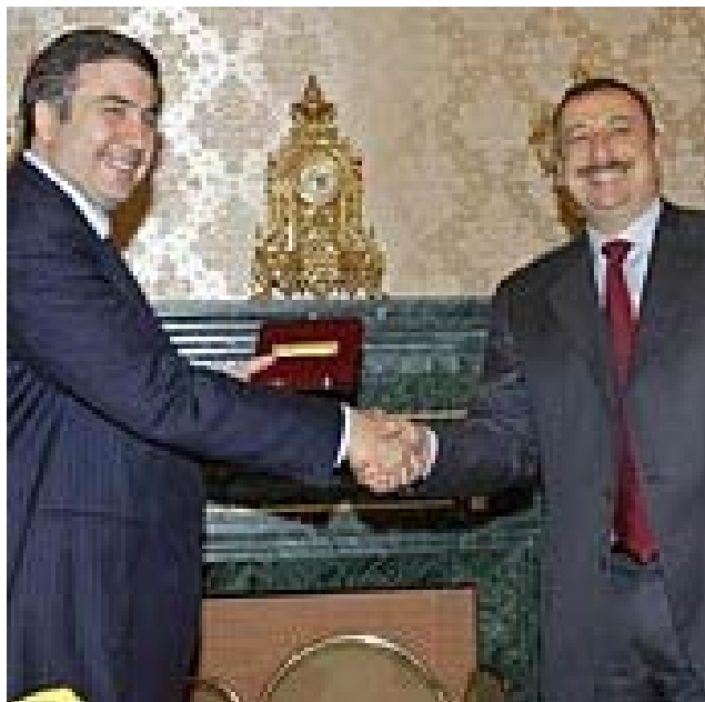
Mikheil Saakashvili & Ilham Aliyev

However, the former President of Georgia, Eduard