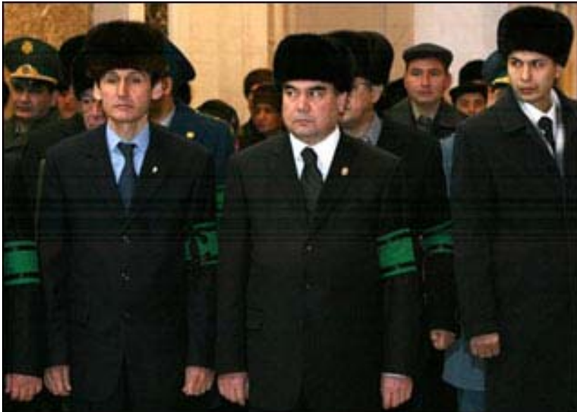
Interim President Gurbanguly Berdymuhammedov

The second important power body was formed around the Presidential Administration. There were several influential people that were almost unknown and even