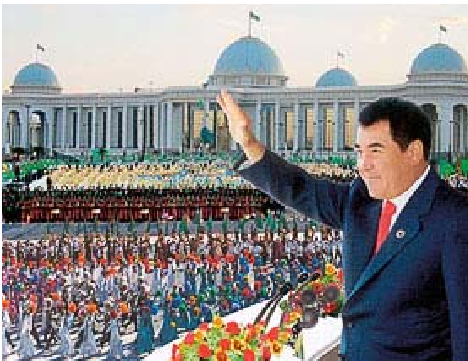
Saparmurat Niyazov, 1940-2006.

in the expected succession struggle. The majority of Turkmenistan's elite is indeed predominantly from the