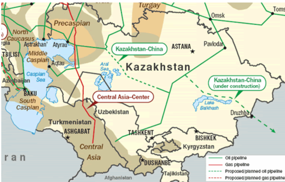
Turkmenistan's Oil and Gas Export Pipeline Network (EIA)

With gas the prime income earner, both the new Turkmen government and Russia are extremely dependent on the continued flow of gas exports. For the Berdymukhammedov administration, access to export revenues will allow the patronage systems put in place by Niyazov to continue, thereby maintaining the status quo among the various competing interests at work in the country. This provides a significant incentive for the centers of power within the security establishment, and various 'bureaucratic mafias' throughout the